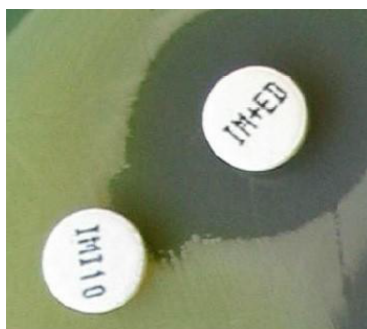
Figure 1. Metallo- \beta -Lactamase Producing Pseudomonas aeruginosa Isolates Identified By a Imipenem-EDTA Double Disk Synergy Test (EDTA-IMP DDST) Phenotypic Confirmatory Test