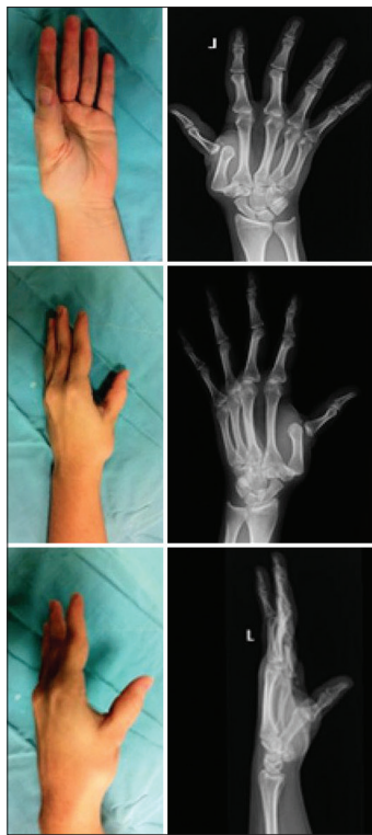
Figure 1: Prereduction pictures and radiographs of the left hand