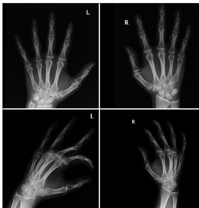
Figure 3: Radiographs of the left hand at 18 th month

In hypermobile patients, close follow-up with repetitive radiograph controls is necessary for the conservative treatment of the floating thumb metacarpal. There is an increased risk of CMC joint redislocation in joint hypermobility syndrome. [11] Recurrent dislocation of the CMC joint following double dislocation of thumb metacarpal in a patient with hyperlaxity was reported. The patient was treated with ligamentoplasty after CMC dislocation reoccurred twice. Suture and pinning or ligamentoplasty were advised as a first management in hypermobile patients. [11] On the other hand, we should be aware of overtreatment in case of stable reduction. Postreduction stability of the joints should be the key point of treatment decision in pure dislocations of the thumb metacarpal.