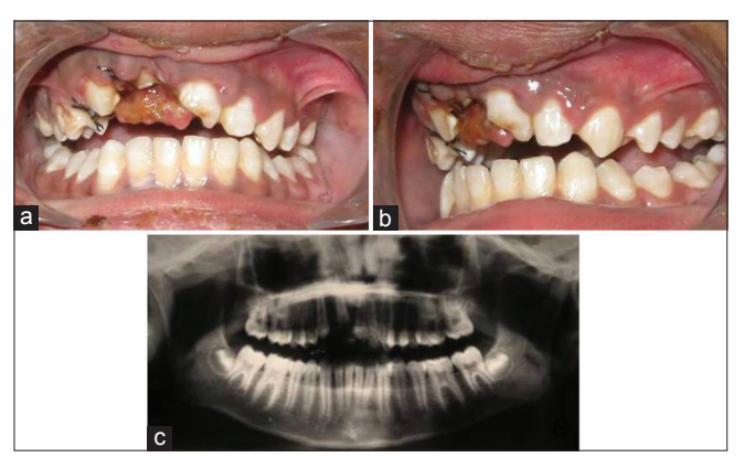
Figure 1: (a and b) Preoperative intraoral images of a 14-year-old boy 20 h after traumatic dental injuries, showing intrusive luxation in 13, 11, and 21 and uncomplicated crown fracture in 14, 11, and 21. (c) Orthopantomogram revealing extent of intrusion and avulsion of 12

Surgical repositioning of 11 was performed with the patient under local anesthesia. Intruded teeth were stabilized by the placement of 0.022 \times 0.028 -inch edge-wise orthodontic brackets (Leone, Anaheim, CA, USA) on 15, 13, 11, 21, 22, 23, and 24 and splinting by 0.016 × 0.022-inch titanium molybdenum alloy (TMA) archwire [Figure 2a-d]. The gingival lacerations were sutured, and the patient was discharged with prescriptions for antibiotics (amoxycillin 250 mg TDS) and analgesics for 5 days. Pulp extirpation was performed in 11 on the 10th day after the injury and was replaced by calcium hydroxide-iodoform paste (Metapex, MetaBiomed, India) with obturation after 2 weeks. Composite restorations were done in 11, 21, and 14, followed by a maxillary 0.016-inch Nickel-titanium archwire ligation and progression to heavy archwires for alignment in the first 3 months. Space closure for the missing tooth 12 was done by means of a 0.016 \times 0.022 -inch TMA archwire with multiple loops in the ensuing 6 months [Figure 3]. The discoloration