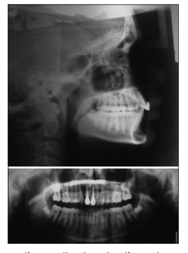
Figure 5: Postoperative posttreatment orthopantomogram and lateral cephalogram