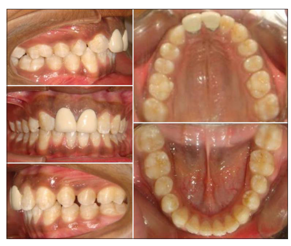
Figure 4: Intraoral images after the completion of orthodontic treatment, endodontic treatment, and placement of metal-ceramic crowns in 11 and 21