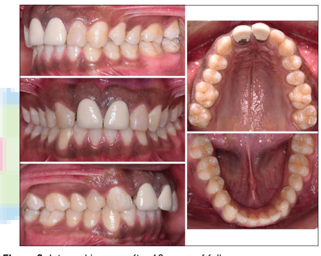
Figure 6: Intraoral images after 10 years of follow-up

One important aspect of combination dental injuries is the sequence of management. A clinical judgment warrants initial management of luxation injuries so that time can be saved for better prognosis and accessibility to the operating field can be improved. [8,9] In the present case, composite build-up was done at the second appointment, while the teeth had been stabilized by flexible splint with orthodontic brackets. Pulp extirpation is a critical step in the prevention of external root resorption of mature permanent teeth, since it reduces the chances of pulp necrosis and subsequent inflammation in periradicular structures. [4,6,8] Endodontic treatment for surgically repositioned 11 was performed on the 10<sup>th</sup> day with an intermediate dressing, followed by obturation after 2 weeks. Luxation injuries often result in the loss of vitality in teeth due to pulp strangulation and necrosis, [6] has occurred in 21, which had to be managed endodontically; although, this did not affect the overall outcome.