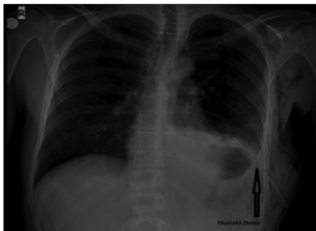
Figure 2: Mislaced tube in the thoracic cavity

The British Thoracic Society defined the safe triangle, a line; it has borders superior to the horizontal level of the nipple, anterior border of the latissimus dorsi, the lateral border of the pectoralis major muscle, and an apex below the axilla. [10] When a chest tube inserted below this area, there are some reports that chest tube ruptured diaphragm and placement to