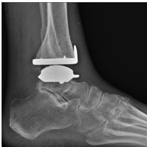
Figure 1: Weight-bearing lateral radiograph of mobile-bearing total ankle replacements (Hintegra)

A total of 117 TARs were included in the study, 59 right-sided (50.4%) and 58 left-sided (49.6%). The main indications for ankle replacement were posttraumatic