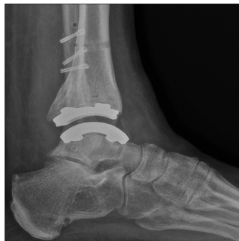
Figure 2: Weight-bearing lateral radiograph of fixed-bearing total ankle replacements (Zimmer Trabecular Metal Total Ankle)