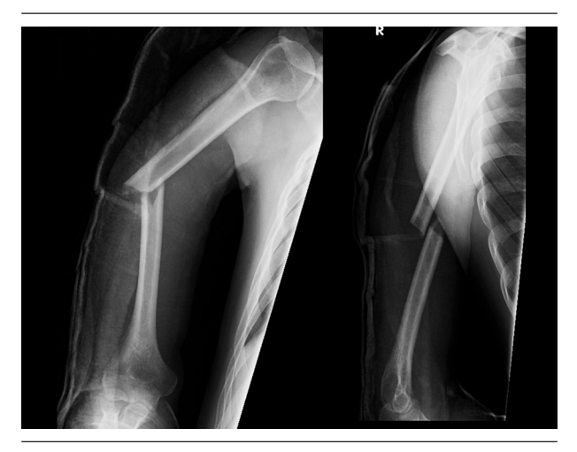
Figure 4. A Radiograph of a Patient One Week Following the Humeral Midshaft Fracture Demonstrating a Perceived Acceptable Position

This systematic review identified two ongoing trails currently being performed in Brazil (11) and the Netherlands (12) to further clarify the outcome of humeral shaft fractures. Matsunaga et al. (11) published their protocol for a two arm randomized controlled trial comparing the outcome of bridge plating with functional bracing. They proposed to recruit 110 patients with humeral shaft fractures. A minimally invasive technique, as described by