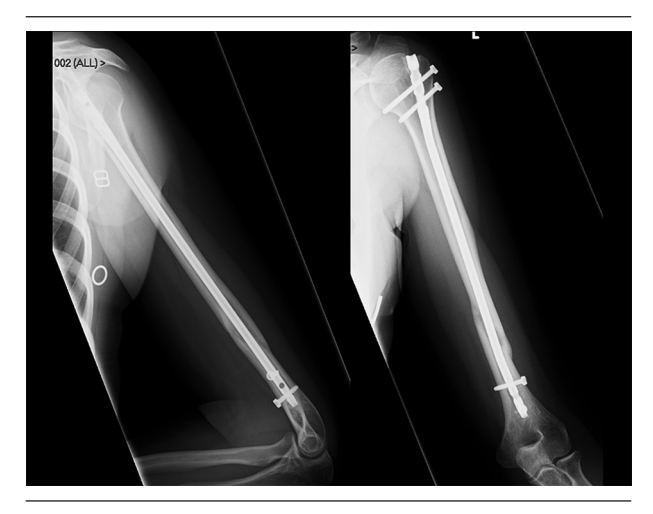
Figure 3. A Radiograph Obtained Nine Months After Primary Intramedullary Nailing of a Segmental Humeral Fracture

were defined to include intramedullary nailing, external fixation and open reduction and plate fixation. Studies comparing different methods of non-operative treatment alone or different methods of operative management alone were excluded.