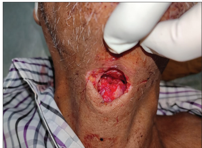
Figure 2: CT scan of the neck with hematoma in the anterior compartment. CT: Computed tomography

jugular vein were wounded, and these blood vessels were examined and ligated. An incision wound on the thyroid cartilage was present, but it did not reach the airway. With 3–0 vicryl, the neck wound was closed in layers. The patient was discharged from the hospital after 1 week after examining the laryngeal airway with help of flexible fiberoptic endoscopy. The follow-up check was done after 1 month and neck wound was healed and voice was within the normal limit without any evidence of residual sequelae.