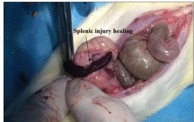
Figure 3: In splenic hilum ligation group, all spleens were viable in the second operations

The short gastric arteries are five to seven small branches arising from splenic artery and passes between the layers