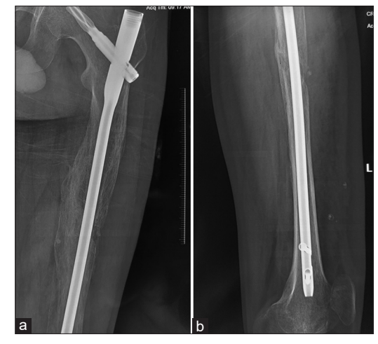
Figure 4: Postoperative anteroposterior (a) and lateral (b) radiographs at 4 months showing fracture union

The management of a fractured bone with an underlying AVM requires elaborate preoperative planning, expert advice of senior consultants, and interdepartmental consultations.