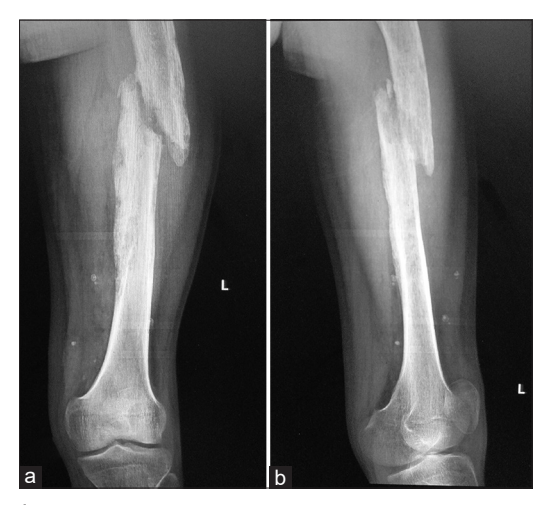
Figure 1: Preoperative anteroposterior (a) and lateral (b) radiographs of left femur fracture with patchy mixed lytic sclerotic bony destruction with periosteal reaction and bony ingrowth into the medullary canal

Preoperatively, the patient was given four sessions of stereotactic external beam radiotherapy. It was decided to proceed with closed reduction and intramedullary fixation without reaming using a cephalomedullary implant as the canal was deemed to be wide enough for a nail based on the radiograph templates and computed tomography (CT) scan. A backup of a vascular surgeon was ready, and intraoperative armamentarium included a distractor set to