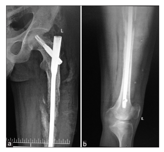
Figure 3: Immediate postoperative anteroposterior (a) and lateral (b) radiographs showing fracture fixation with the proximal femoral nail with satisfactory alignment and reduction

Kumar et al.: Femur fracture with arteriovenous malformation treated with nail