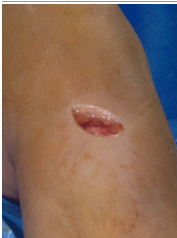
Figure 2. Oblique Incision