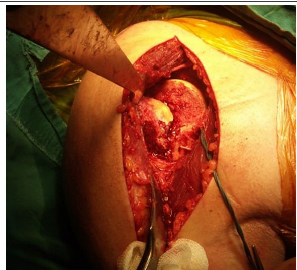
Figure 2. Following the Deltopectoral Approach, Glenohumeral Joint Was Reduced

Approximately 40% of the articular surface was collapsed laterally and malunited to the metaphyseal region. This image was proportioned and scaled with the postoperative images at the same level of the humeral head to note how great is the articular fragment.