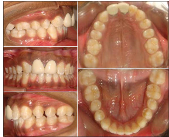
Figure 4: Intraoral images after the completion of orthodontic treatment, endodontic treatment, and placement of metal-ceramic crowns in 11 and 21