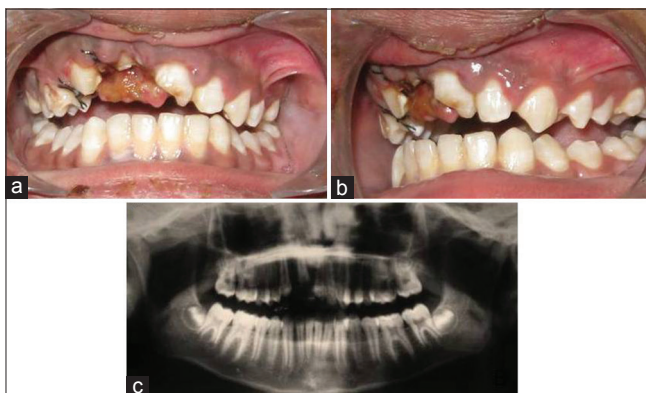
Figure 1: (a and b) Preoperative intraoral images of a 14-year-old boy 20 h after traumatic dental injuries, showing intrusive luxation in 13, 11, and 21 and uncomplicated crown fracture in 14, 11, and 21. (c) Orthopantomogram revealing extent of intrusion and avulsion of 12

“Combination TDI” presents with unique scenarios requiring rapid decision-making based on evidence-based protocols. The present case was managed according to the IADT guidelines of 2007 (the TDI occurred in 2007), focusing on intrusive luxation, avulsion, and uncomplicated crown fractures of the permanent dentition. [2,3] Teeth with intrusion >7 mm were recommended for immediate surgical repositioning, while those <7 mm could be managed by orthodontic extrusion. [2,6] In this case, 11 was surgically repositioned and stabilized, whereas 21 and 13 were extruded orthodontically. Andreasen et al. emphasized that the adverse consequences of intruded permanent teeth are based on the age of the patient, the stage of root development, tooth location, and the extent of injury. [6] Recommendations for the management of intrusion are aimed at the prevention of tooth ankylosis, which might start with time. [2,4,7]