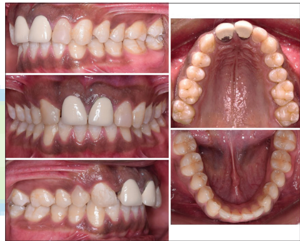
Figure 6: Intraoral images after 10 years of follow-up

One important aspect of combination dental injuries is the sequence of management. A clinical judgment warrants initial management of luxation injuries so that time can be saved for better prognosis and accessibility to the operating field can be improved. [4,6,9] In the present case, composite build-up was done at the second appointment, while the teeth had been stabilized by flexible splint with orthodontic brackets. Pulp extirpation is a critical step in the prevention of external root resorption of mature permanent teeth, since it reduces the chances of pulp necrosis and subsequent inflammation in periradicular structures. [4,6,8] Endodontic treatment for surgically repositioned 11 was performed on the 10 th day with an intermediate dressing, followed by obturation after 2 weeks. Luxation injuries often result in the loss of vitality in teeth due to pulp strangulation and necrosis, [6] has occurred in 21, which had to be managed endodontically; although, this did not affect the overall outcome.