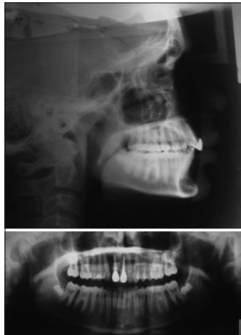
Figure 5: Postoperative posttreatment orthopantomogram and lateral cephalogram