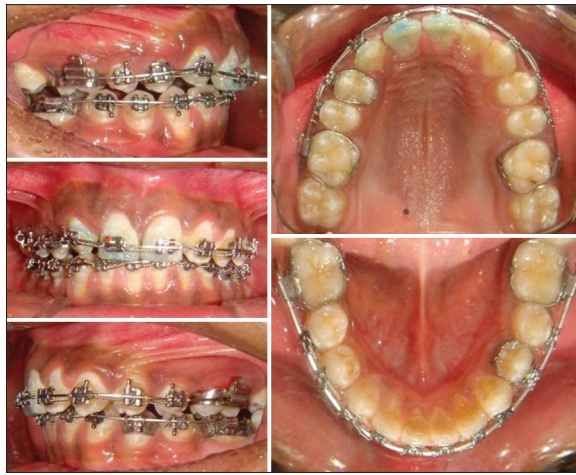
Figure 3: Intraoral images of the patient's orthodontic appliances in the maxillary and mandibular arches