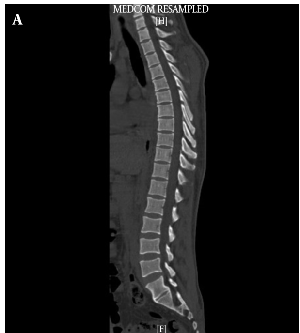
Figure 2. Computerized Tomography of Spine Showing Fracture of Head of 11th Rib and no Other Bony Injury

root leading to its avulsion and force transmission to the spinal cord and cord injury. In our case, the patient was hit by a four-wheeler from behind while he was pushing another vehicle. The displacement at the spinal column could have been prevented by the rib cage (though one of the rib heads got fractured due to the impact) but hyperextension at the thoracic spine with buckling of ligamentum flavum could have led to the injury of the spinal cord. The few reported cases in the literature of the thoracic SCIWORA were managed conservatively (9, 13). Some of the authors had included steroids as part of their treatment along with bed rest. The use of steroids is