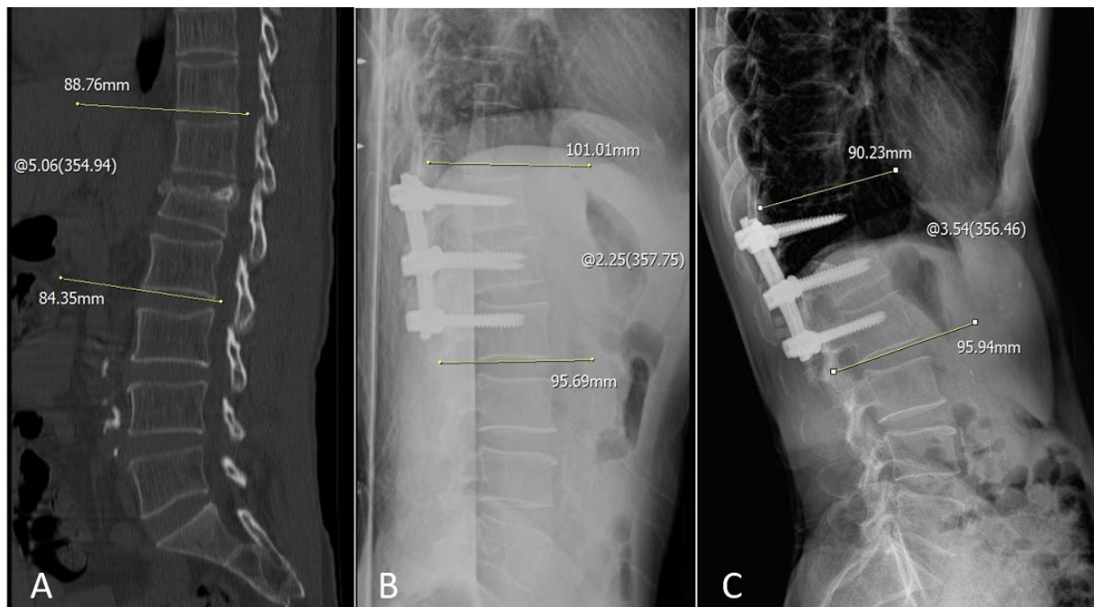
Figure 3. (A) Sagittal CT scan of a 45-year-old man with a burst fracture of L1 after a collision in a traffic accident. (B) Postoperative scan demonstrates T12-L2 instrumentation. (C) Thoracolumbar 6-month follow-up X-ray representing the stability of the thoracolumbar spine and good arrangement of fractures and Cobb's angle was recovered a little.

Short-segment pedicle screw fixation has been considered as the most common surgical treatment for thoracolumbar burst fractures in comparison with conservative treatment; it leads to effective and faster pain relief, correction of kyphosis, and reduces the period of immobility. [8] However, long-term clinical studies have demonstrated surgical morbidities and disadvantages,