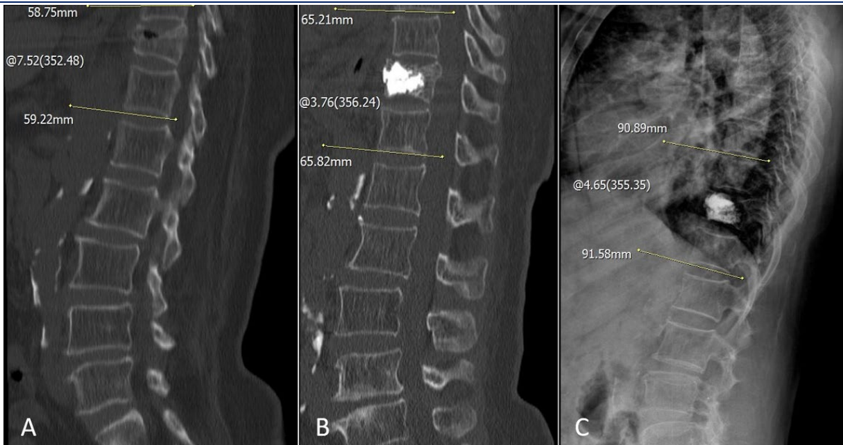
Figure 2. (A) A 60-year-old woman with T11 burst fracture after a fall from 3-m height. (B) Postoperative thoracolumbar CT scan of T11 fracture treated with vertebroplasty, showing no obvious bone cement leakage and good diffusion of bone cement. (C) 6-month follow-up, X-ray films displayed the vertebral height and Cobb's angle was well recovered.