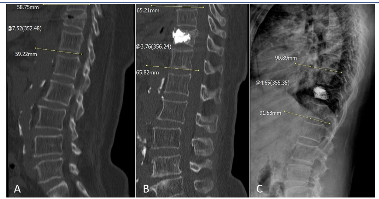
Figure 2. (A) A 60-year-old woman with T11 burst fracture after a fall from 3-m height. (B) Postoperative thoracolumbar CT scan of T11 fracture treated with vertebroplasty, showing no obvious bone cement leakage and good diffusion of bone cement. (C) 6-month follow-up, X-ray films displayed the vertebral height and Cobb's angle was well recovered.