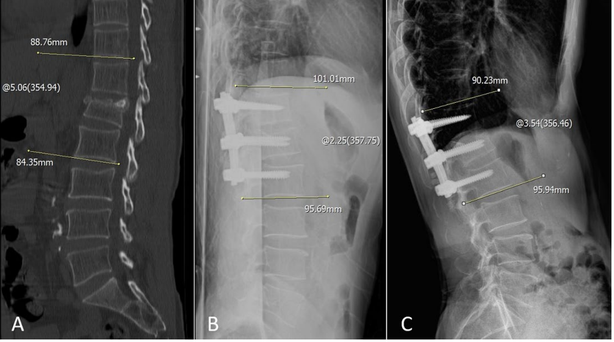
Figure 3. (A) Sagittal CT scan of a 45-year-old man with a burst fracture of L1 after a collision in a traffic accident. (B) Postoperative scan demonstrates T12-L2 instrumentation. (C) Thoracolumbar 6-month follow-up X-ray representing the stability of the thoracolumbar spine and good arrangement of fractures and Cobb's angle was recovered a little.

Short-segment pedicle screw fixation has been considered as the most common surgical treatment for thoracolumbar burst fractures in comparison with conservative treatment; it leads to effective and faster pain relief, correction of kyphosis, and reduces the period of immobility.[8] However, long-term clinical studies have demonstrated surgical morbidities and disadvantages,