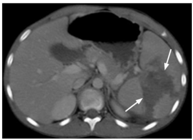
Figure 2. The figure shows evidence of hypodensity suggestive of splenic laceration with hematoma seen within the spleen extending medially to the hilum and peripherally to the capsule, being labelled as CT grade 3 spleen injury