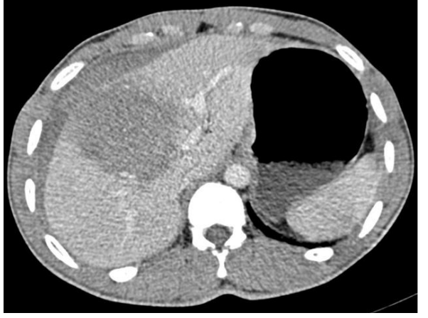
Figure 3. This figure shows evidence of an ill-defined hypodensity within the liver parenchyma suggestive of intrahepatic hematoma extending up to the liver capsule with associated subcapsular hematoma indicating CT grade 4 Liver injury.