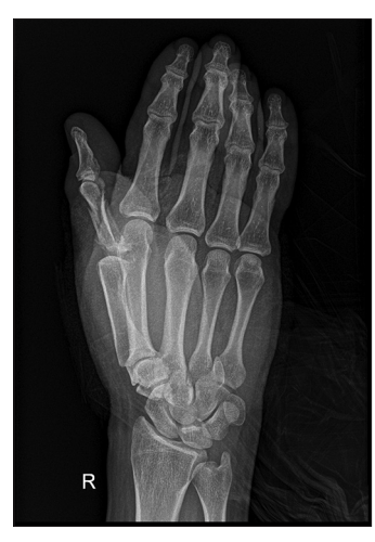
Figure 1: Preoperative image showing complex, open, and comminuted fracture of the proximal phalanx of the right thumb

Alexander: Mini-fixators for hand fractures