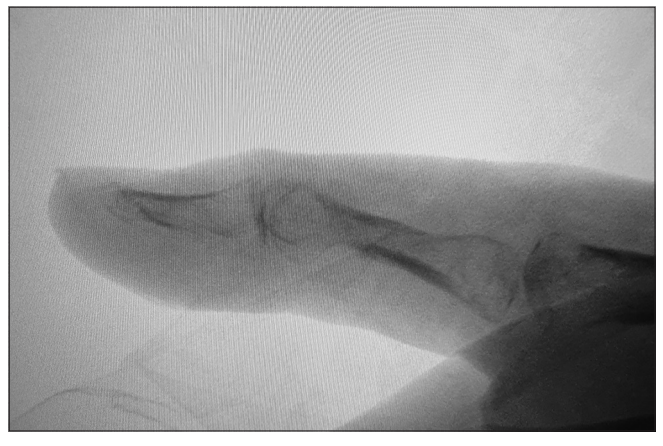
Figure 4: Follow-up of X-ray at 5 weeks after removal of minifixator

technically demanding, and obstruct fluoroscopy visualization due to their bulkiness and radiopacity.<sup>[3-6]</sup>