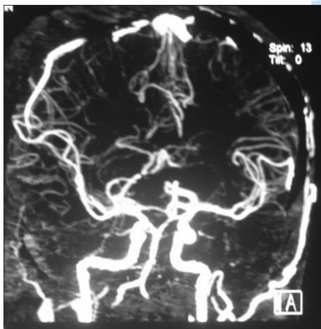
Figure 3: Post-op CT angiography of the presented case