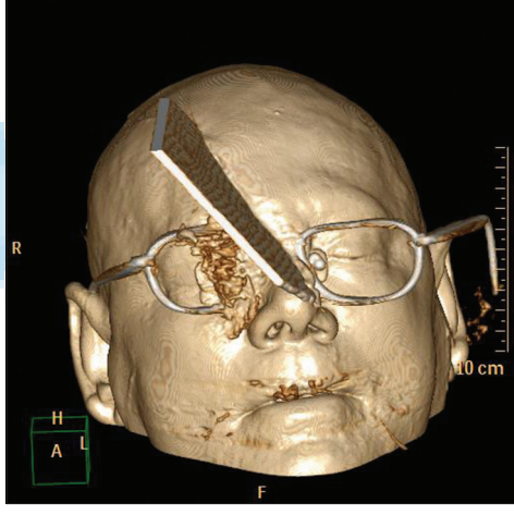
Figure 2: Three-dimensional recontruction of craniofacial impalement

Embedded foreign objects from impalement often offer a tamponade effect even when a major vascular injury is present. For this reason, when an impalement injury is encountered, the object should be gently stabilized and only removed in the operating room where massive hemorrhage can be controlled