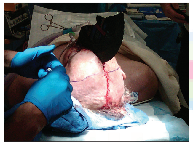
Figure 1: Perioperative image demonstrating the skin flap site for bilateral craniotomy marked out in purple

After neurosurgical and otolaryngological consultation, the patient was taken to the operating theater where a skin flap was raised, and the temporalis muscles were reflected exposing the root of bilateral zygomas. A single burr hole was placed at the root of the zygomas, and bilateral craniotomy was performed up to the level of the saw blade. The saw blade and glasses were removed, and the anterior sagittal sinus was ligated with a nonabsorbable suture, both proximal and distal to the injury. Further hemostasis was achieved using bipolar electrocautery. After thorough irrigation with normal saline mixed with bacitracin, we made sure that we had achieved hemostasis, then placed surgical on the lacerated cortical brain. An intracranial pressure (ICP) monitor was placed, the dura was then reapproximated and covered with DuraGen, and the bone flaps were replaced and secured into place. Postoperatively, he was awake and alert with a Glasgow Coma Scale of 15 and no