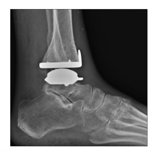
Figure 1: Weight-bearing lateral radiograph of mobile-bearing total ankle replacements (Hintegra)

Our postoperative schedule consisted of a nonweight-bearing period of 4 weeks with a short-leg cast, and then, partial weight-bearing with a brace was allowed for 2 weeks. Full weight-bearing and a rehabilitation program (calf strengthening, proprioceptive training, and stretching of the triceps surae) were started 6 weeks postoperatively. Low-impact sports and activities such as swimming or