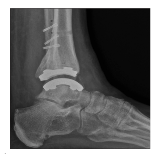
Figure 2: Weight-bearing lateral radiograph of fixed-bearing total ankle replacements (Zimmer Trabecular Metal Total Ankle)

A total of 117 TARs were included in the study, 59 right-sided (50.4%) and 58 left-sided (49.6%). The main indications for ankle replacement were posttraumatic