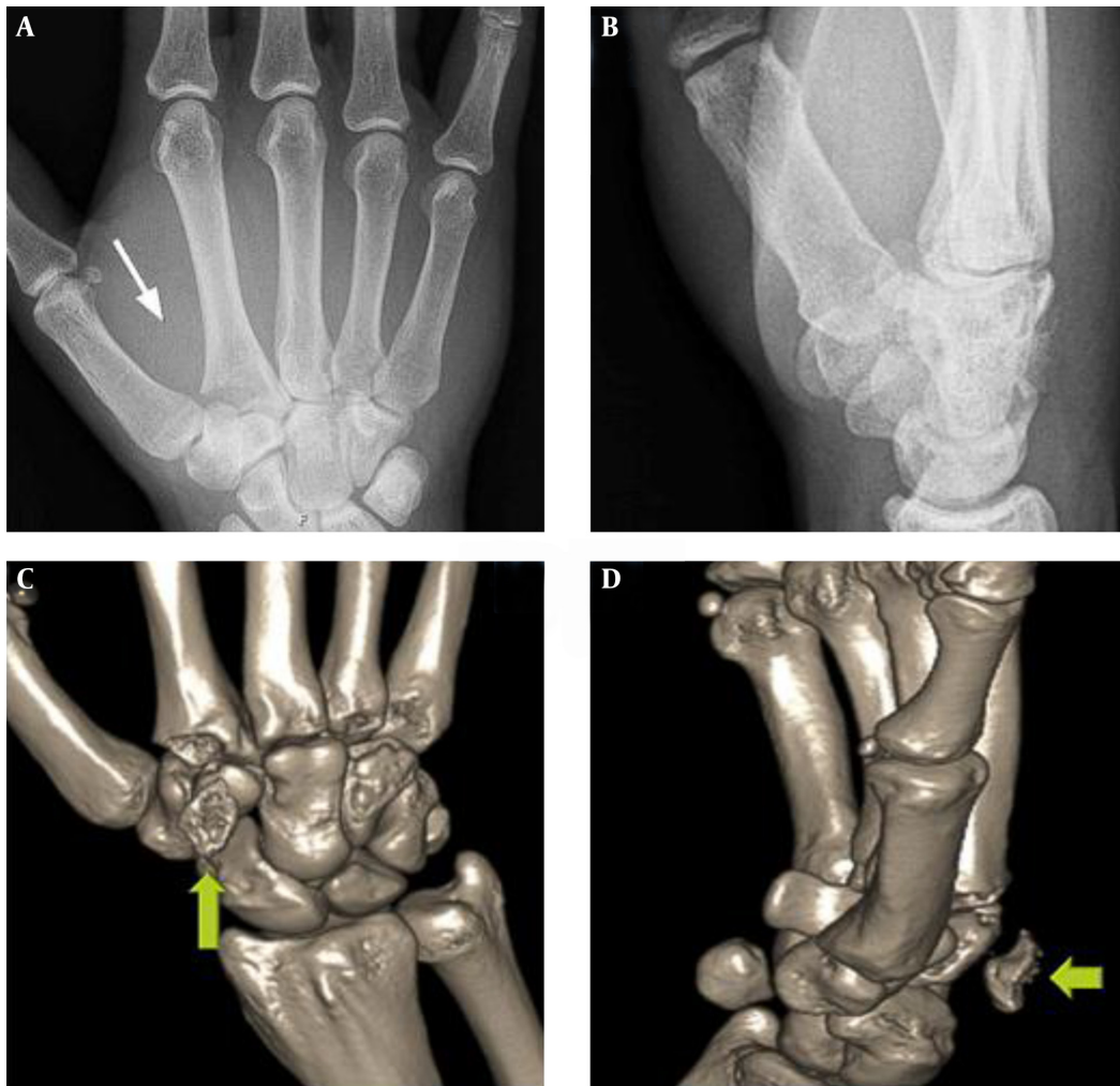
Figure 1. A and B, AP and lateral radiographs; C and D, and AP and lateral 3D reconstruction CT images; taken at the time of the injury, the arrows demonstrate the fragment that attaches to the ecll tendon.