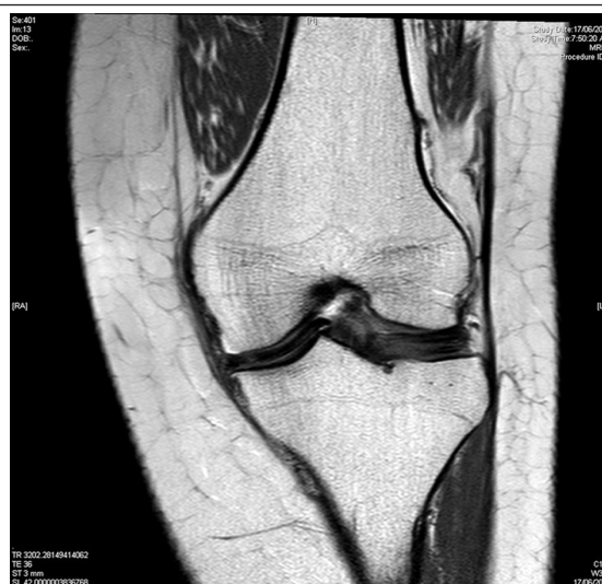
Figure 1. Magnetic Resonance Imaging Coronal Section Showing the Discoid Meniscus

type, in the other. Horizontal cleavage tears were found in both knees. Partial medial meniscectomies were performed bilaterally, with resection of the central portion of the discoid meniscus. Physiotherapy was commenced immediately postoperatively, with isometric exercises and weight bearing, as tolerated. The patient was symptom free at a 12-month follow-up. Examination revealed no joint line tenderness, with negative McMurray testing and full range of movements.