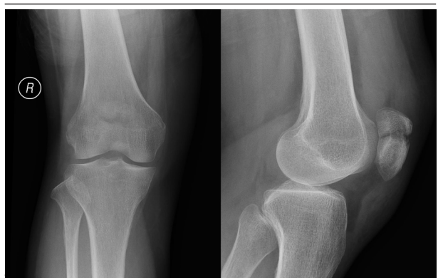
Figure 1. Radiographs Showed Displaced Fracture of the Patient's Right Patella

wards. Clinically, the extensor mechanism of her right knee was lost. Radiographs showed displaced fracture of her right patella (Figure 1). Open reduction and internal fixation was performed. Intra-operatively, it was complicated by a coronal split fracture during tensioning of the cerclage wire. The cerclage wire was reapplied posteriorly. The split fracture was reduced and fixed with five 2 mm screws. The fixation was augmented with a figure-of-eight tension band wire (Figure 2). Post-operatively, a hinged knee brace was applied. The knee was immobilized in extension for two weeks and gradual mobilization in the brace for another six weeks. Bone densitometry was checked after the operation. The T score was -1.4. The fracture healed eight weeks after the operation (Figure 3). Upon 24 months of follow-up, the range of motion of her right knee was 0 to 100 degrees of flexion. There was some knee discomfort during flexion by irritation of the wire loop. The patient refused removal of the implants.