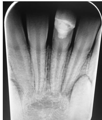
Figure 3: Root closure