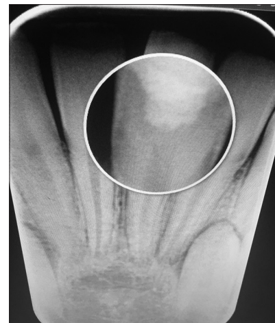
Figure 4: Dental bridge, complete root closure

In a case report conducted by Vâlceanu and Stratul [23] after the endodontic treatment, the patient was treated using the combination of several techniques: periodontal surgery (crown lengthening with apically repositioned flap and osseous