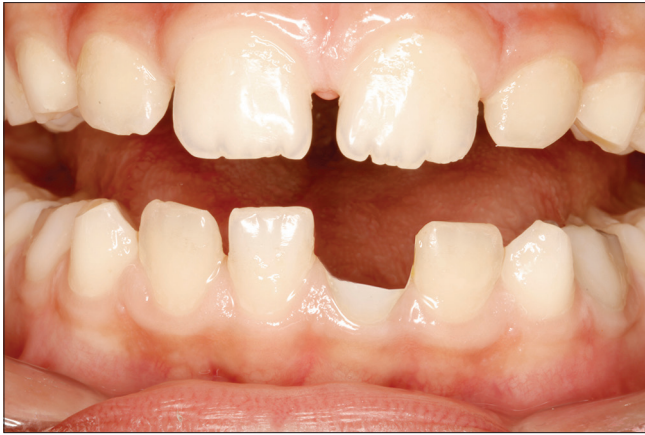
Figure 5: Before treatment

resective surgery), adhesive technique, and cast restoration plus esthetic crown.