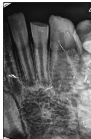
Figure 1: Complicated crown fracture

The status of pulp was evaluated by pulp sensitivity tests, which included cold testing with ice stick, and readings of pulpal response were recorded by an electric pulp tester (Parkell Inc.,